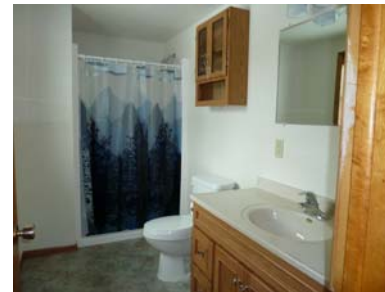
M. BEDROOM 3/4 BATH OFF M. BEDROOM