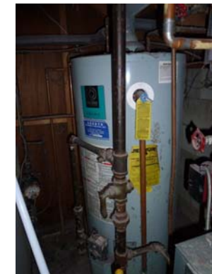
Gas water heater