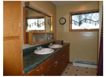
Full bath up