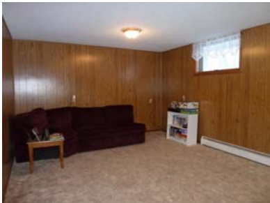
Family room down