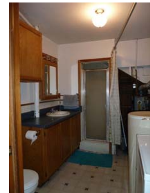
3/4 bath down with laundry

All information provided is deemed reliable but is not guaranteed by First Choice Realty or any agent affiliated with the MLS and should be independently verified.