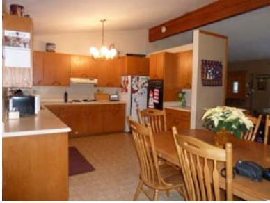
Kitchen & dining