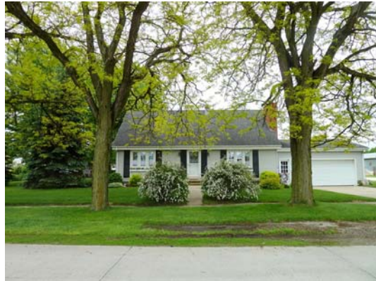
CONC PATIO [192]